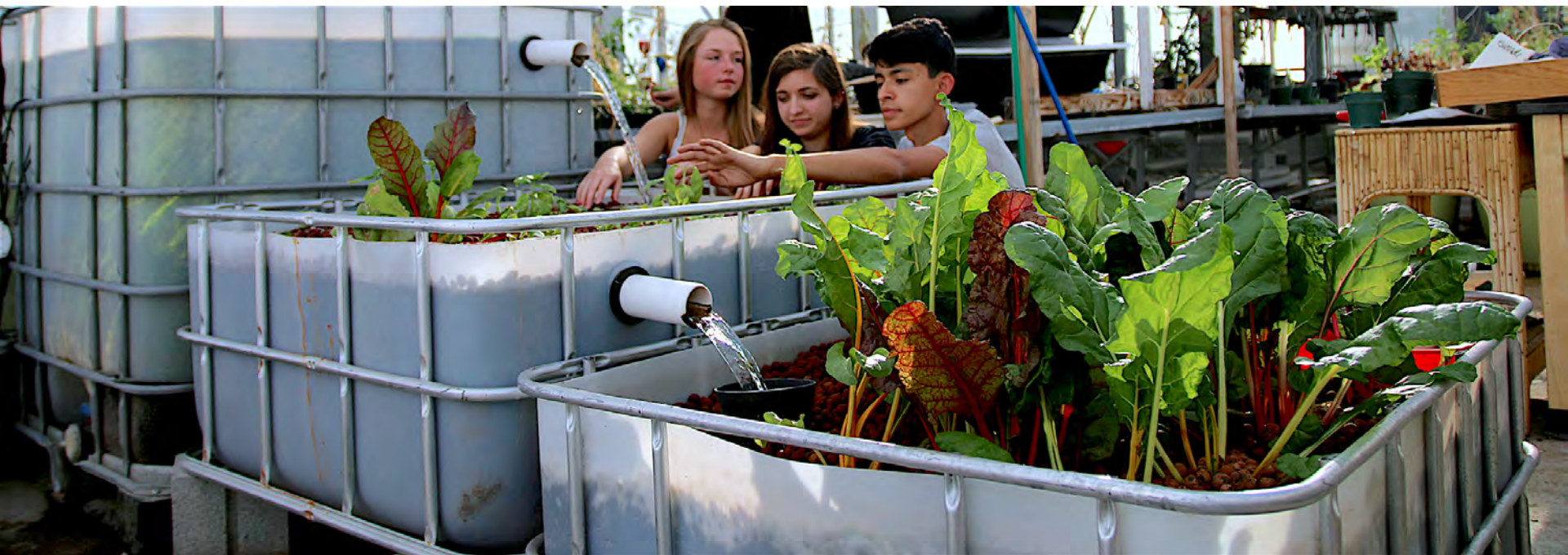
Students working on the THMS Aquaponics System