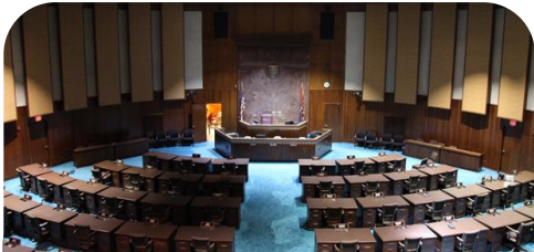
House = 60 Members