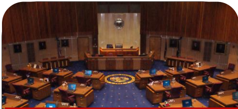
Senate = 30 Members