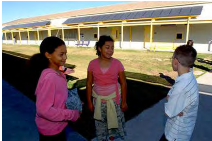
Davidson students enjoying shade from the solar panels