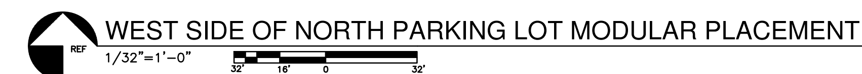
WEST SIDE OF NORTH PARKING LOT MODULAR PLACEMENT

MEN: 4 NEW WATER CLOSETS, 4 NEW LAVS. WOMEN: 4 NEW WATER CLOSETS, 4 NEW LAVS. 1 UNISEX RESTROOM. 2 DRINKING FOUNTAINS 1 SERVICE SINK