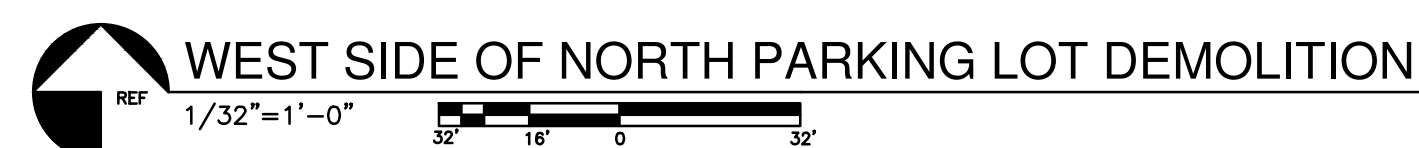
WEST SIDE OF NORTH PARKING LOT DEMOLITION