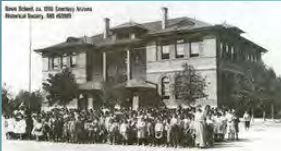
Beginning in 1901