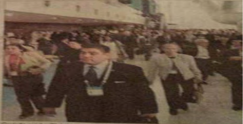
Guests and officials at the 5th edition of the WISE at the QNCC in Doha, on Tuesday.