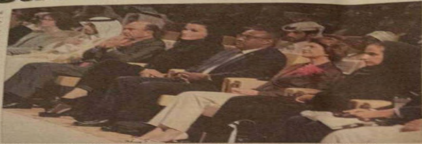
Her Highness Sheikha Moza bin Nasser with other dignitaries at the opening session of WISE 2013 on 'reinventing education for life', in Doha, on Tuesday.

The day-long event featured a number of prominent speakers and engaging topics. Distinguished French sociologist and