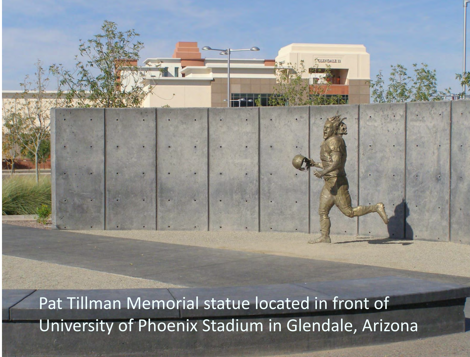
Pat Tillman Memorial statue located in front of University of Phoenix Stadium in Glendale, Arizona